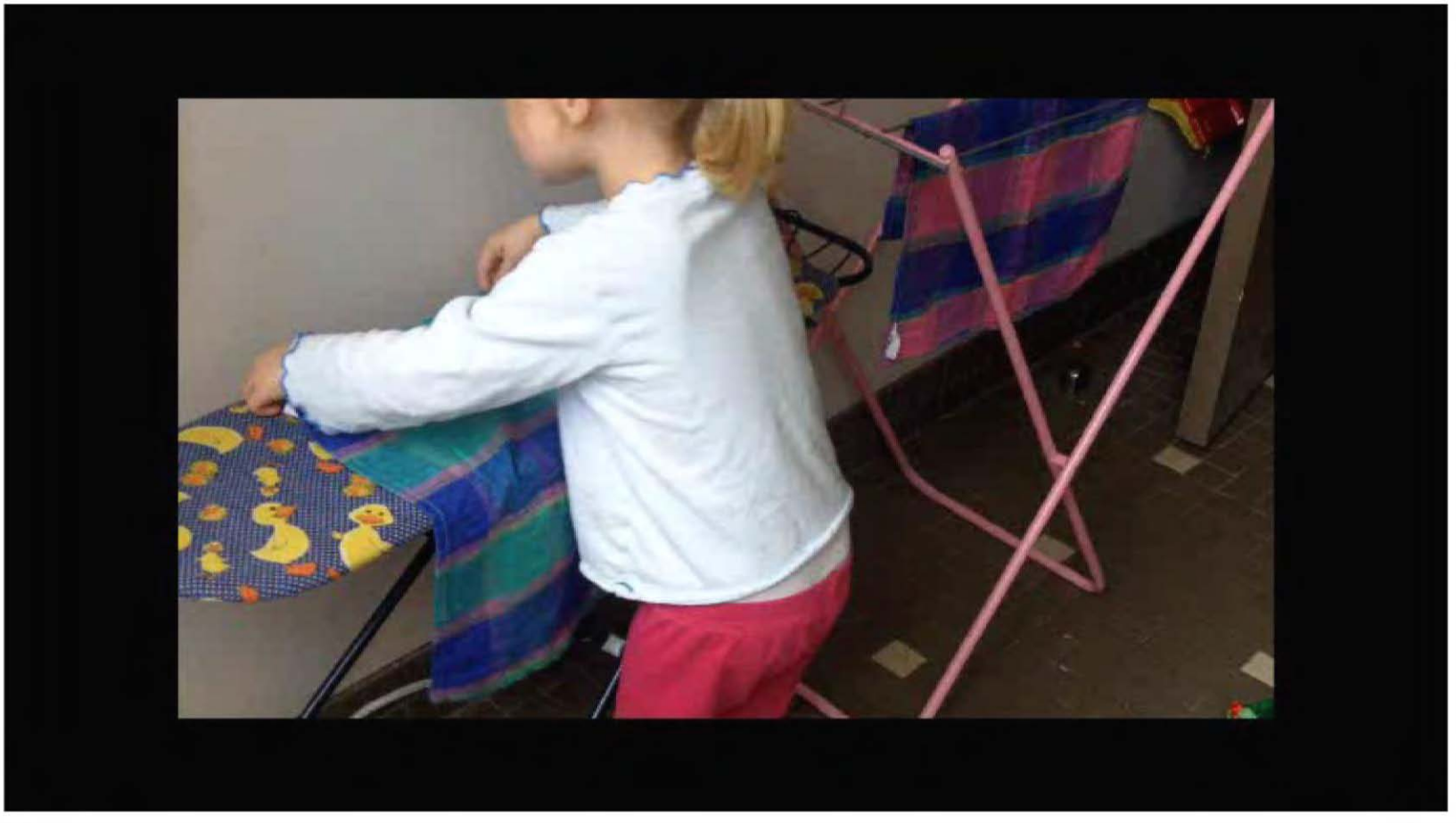
Rosemary – age 2 3 / 4